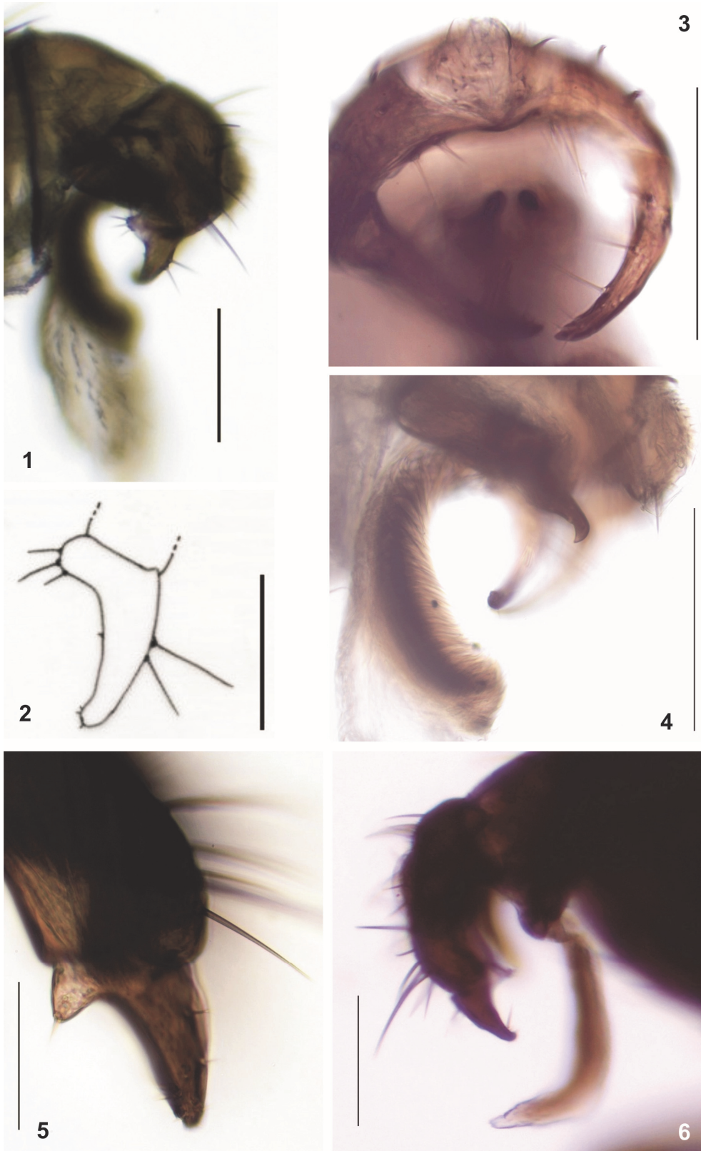
Fig. 1-6. 1-4) Meoneura obtusangula sp.n.: 1) male genitalia, laterally; 2) surstylus + lamella, broadest view; 3) surstyli, posteriorly; 4) postgonite and aedeagus (proximal part), laterally. 5-6) Meoneura acuticerca Gregor: 5) surstylus + lamella, laterally; 6) male genitalia, laterally. Scales: 1,3,4,6 = 100 \mu m; 2,5 = 50 \mu m.